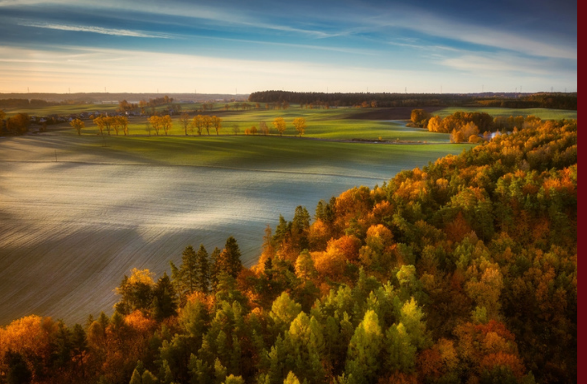
KASHUBIAN FOREST, WEST OF GDANSK, POLAND